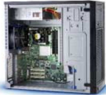
Intel® Entry Server Chassis SC5250-E

Intel® PRO Server Adapters , including Gigabit Ethernet server adapters, help to reduce bottlenecks and boost availability with industry-leading performance and advanced server features.